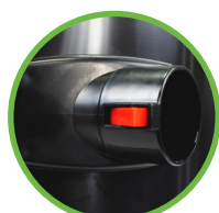
50MM CYCLONIC SIDE ENTRY PORT