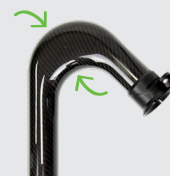
Hairpin Neck Tool Holder EU Registered Design No: 008458913