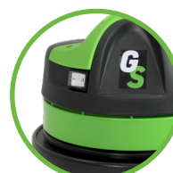
SINGLE MOTOR WITH ON/OFF