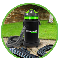
COMPACT AND LIGHTWEIGHT