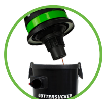
REMOVABLE VACUUM HEAD