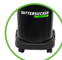
IMPACT RESISTANT BUMPER SKIRTS